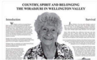
Wellington Publication 2012