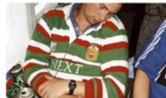
Flight 934-B 2000

My art-based practice has entailed over 55 exhibitions since 1995. I have been awarded several grants, prizes and three scholarships. My work is held in private and public collections. My practice is documented on the following website: http://mathieugallois.com/ .