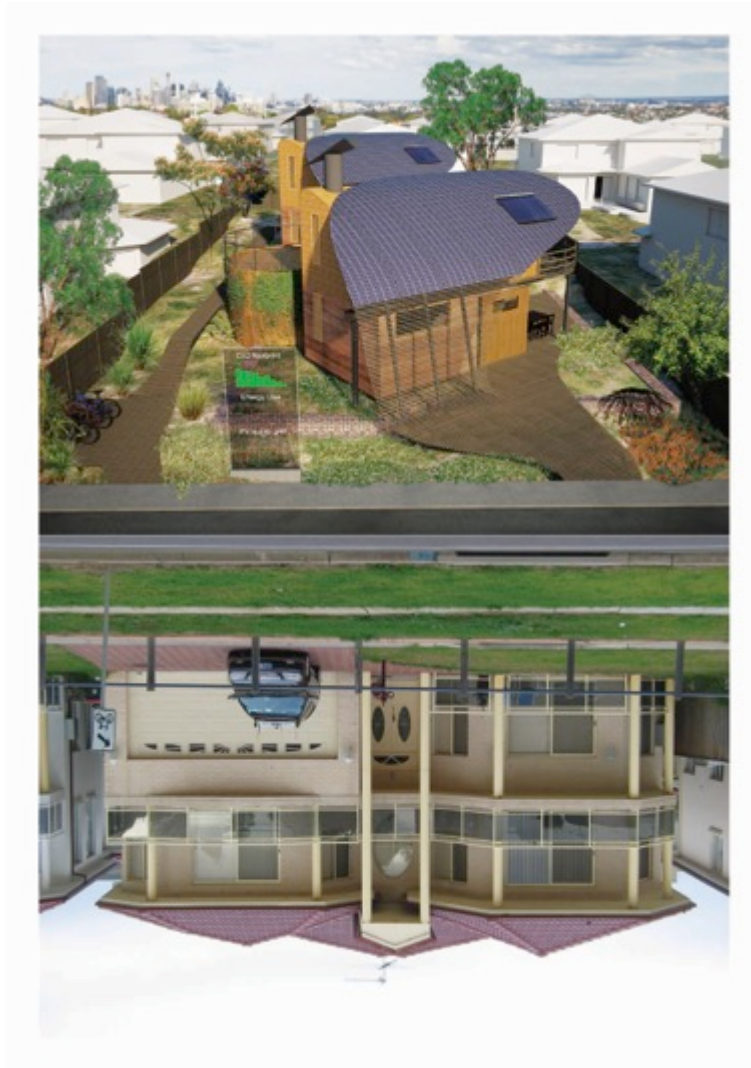
Reincarnated McMansion project. Digital visualisation (2013) and photograph of existing McMansion (2009). http://reincarnatedmcmansion.com/

My most recent architectural employment has entailed working for CplusC Design Construct and Smyth & Smyth as an architect's assistant. Project budgets ranged from $300,000–$5,000,000. Between 2016 and 2018, I completed my first solo architectural commission.