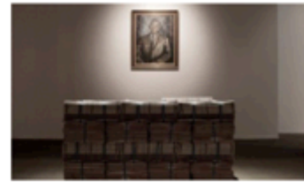
Wellington Project Exhibition 2012