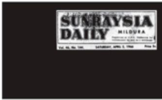
The Sunraysia Daily 1966-1974 2013