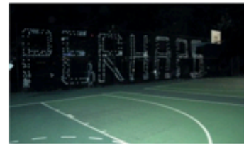
Support Doubt Series 2007