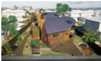
Reincarnated McMansion Project 2009