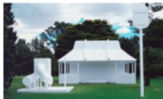
Drive Thru 2001