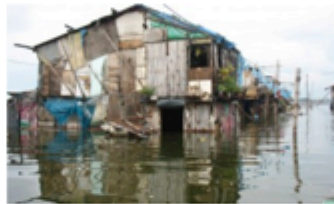
I House = 1000 Homes 2009